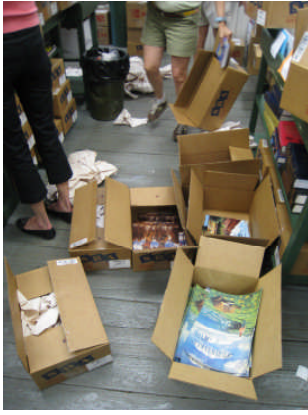
Volunteers recently unpacked a large shipment of children's paperback books from McGraw-Hill.